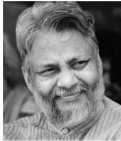
Dr. Rajendra Singh

Ramon Magsaysay Awardee, Waterman of India